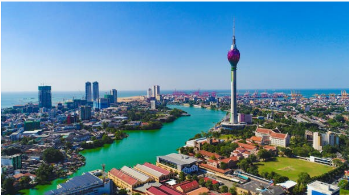
Day 5 – Bentota – Colombo - City tour in Colombo and shopping