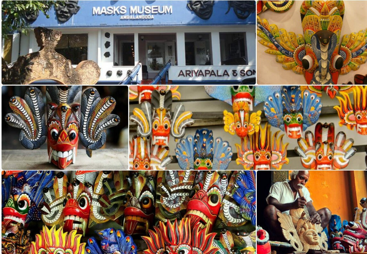
Day 4 – Turtle hatchery , and Madhu river boat safari . Ambalangoda mask factory , Kandhe vihara temple , optional water sports